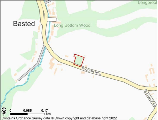
59867 Plough Hill, Basted